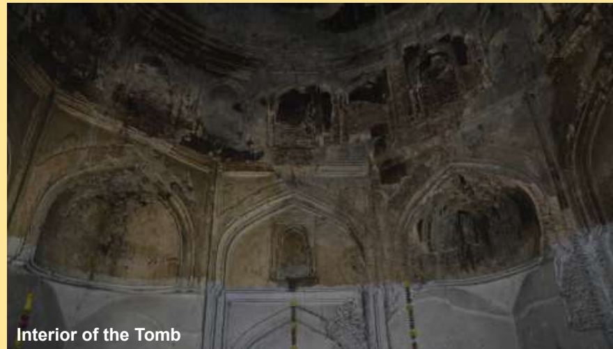
Interior of the Tomb